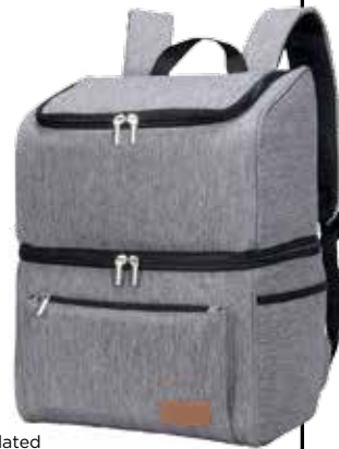
Lifewit Insulated Cooler Bag BACKPACK , $38, amazon.ca.