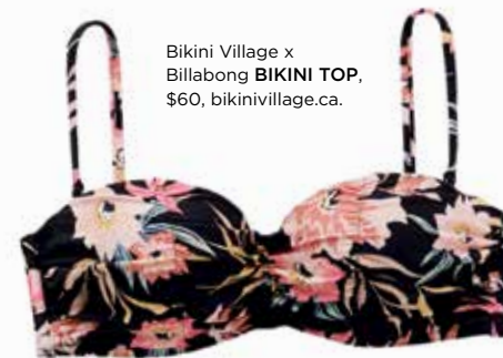
Bikini Village x Billabong BIKINI TOP, $60, bikinivillage.ca .