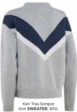
Kari Traa Songve Knit SWEATER , $110, altitude-sports.com.