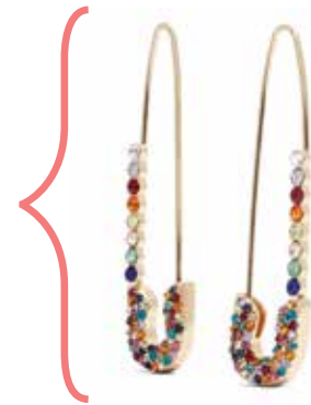
Alcheringa EARRINGS , $14, aldoshoes.com.

We love these dangling safety-pin-shaped earrings that boast just enough colour while being subtle enough to not overwhelm your look.