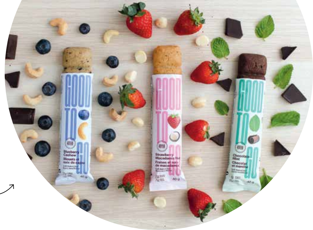
GoodToGo Soft Baked BARs , $29/9-pack, good2gosnacks.ca.

Vegan, grain-free, gluten-free, peanut-free and keto-certified to boot, these soft-baked bars are healthy and totally satisfying. Check out the newest flavours: Blueberry Cashew, Strawberry Macadamia Nut and Chocolate Mint—seriously delicious!