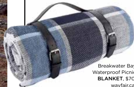
Breakwater Bay Waterproof Picnic BLANKET , $70, wayfair.ca.