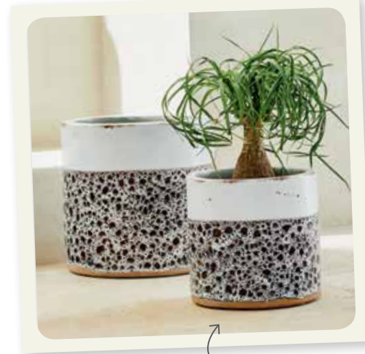
Yara Two Tone PLANTERS , $55-$85, cb2.ca.

For more stylish garden accessories, see our Garden Party story on page 54.