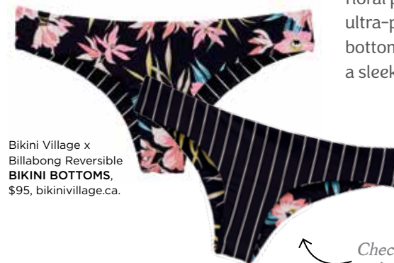
Bikini Village x Billabong Reversible BIKINI BOTTOMS, $95, bikinivillage.ca .