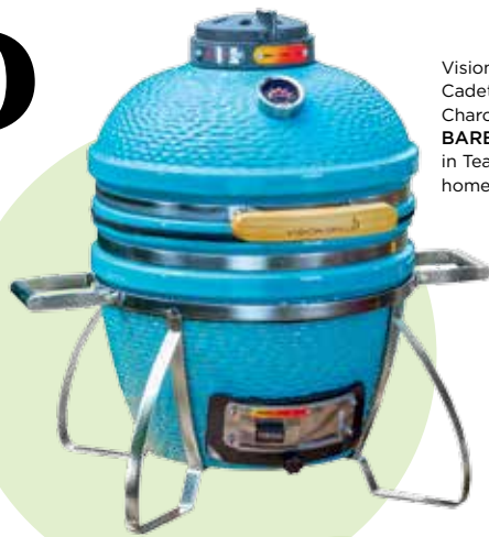
Vision Grills Cadet Kamado Charcoal BARBECUE in Teal, $599, homedepot.ca.

Use this wireless thermometer with the downloadable Meater app, and it'll tell you when your meat is cooked to your desired doneness. Barbecuing has never been easier!