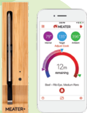
Meater Wireless INSTANT-READ THERMOMETER , $169, meater.com.

Use this wireless thermometer with the downloadable Meater app, and it'll tell you when your meat is cooked to your desired doneness. Barbecuing has never been easier!