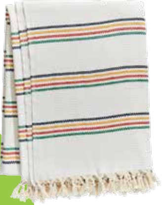
HBC Stripes x B Yoga Full Body TOWEL , $50, thebay.com.