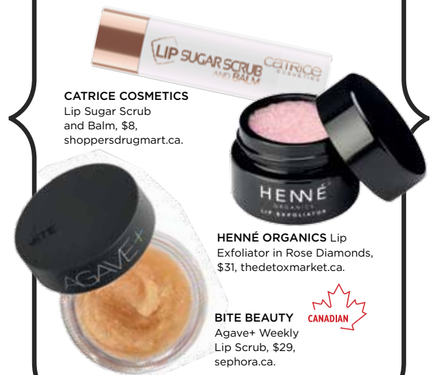
CATRICE COSMETICS Lip Sugar Scrub and Balm, $8, shoppersdrugmart.ca.

Beach breezes and summer sun chapping your lips? Keep them soft and supple with one of these luscious lip scrubs.