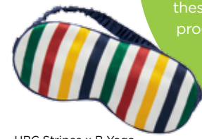
HBC Stripes x B Yoga SLEEP MASK , $50, Lavender Silk EYE PILLOW , $40, thebay.com.