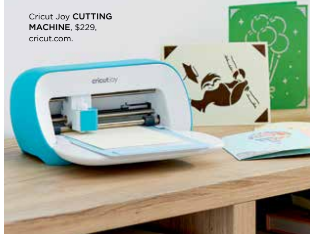
Cricut Joy CUTTING MACHINE , $229, cricut.com.

We love the newest innovation from Cricut. The Joy cutting machine is both lightweight and compact, perfect for the DIY dabbler or crafting connoisseur to whip off quick, fun everyday projects and more! Create your own design and the machine takes care of the rest.