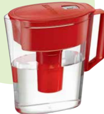
Brita Soho WATER PITCHER , $20, amazon.ca.

Brita's new Soho five-cup pitcher provides you with the same fresh-tasting, clean water you get from all the brand's pitchers, with the benefit of being specially sized to fit small-space fridges like those in dorms, condos and offices.