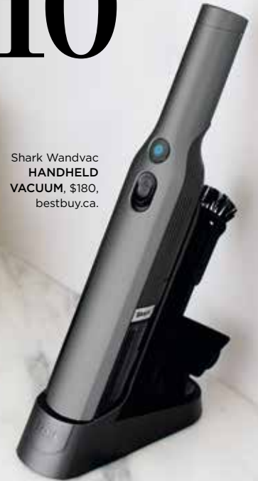
Shark Wandvac HANDHELD VACUUM , $180, bestbuy.ca.