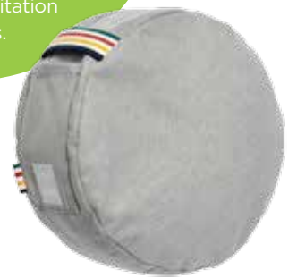
HBC Stripes x B Yoga MEDITATION CUSHION , $110, thebay.com.