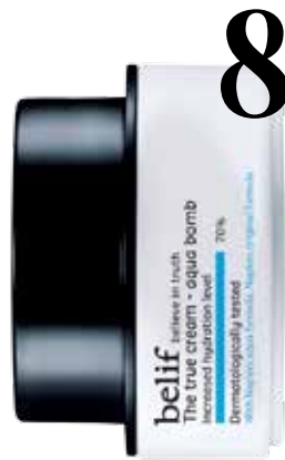
BELIF The True Cream Aqua Bomb, $50, avon.ca.

Perfect for hot days, Avon's Aqua Bomb moisturizer is refreshing, cooling and ultra-lightweight. Plus, it provides serious hydration without leaving your skin feeling sticky. Need more hydrating power? Try the luxurious Moisturizing Bomb.