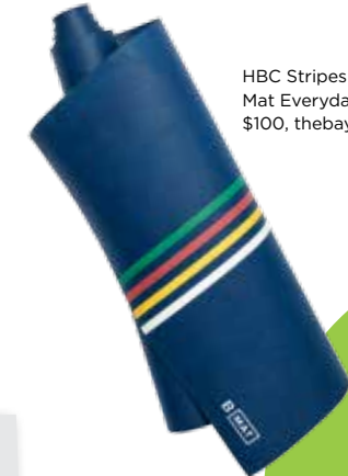
HBC Stripes x B Yoga B Mat Everyday YOGA MAT , $100, thebay.com.

B.C.-based B Yoga and Hudson's Bay have teamed up to create these beautifully designed wellness products to bring dependable and stylish function to your yoga and meditation practices.