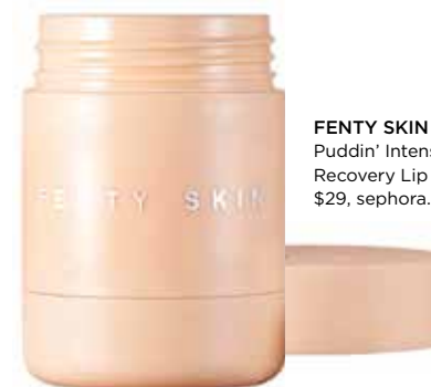
FENTY SKIN Plush Puddin' Intensive Recovery Lip Mask, $29, sephora.ca.

There's no doubt that singer Rihanna is busy—in addition to being a new mom and putting together that Super Bowl Halftime Show performance, she's also blessing our bathroom counters with all sorts of new products from her skin-care brand Fenty Skin. Our current favourite is a lip mask with hydrating pomegranate, jojoba, coconut and castor oils that perfectly conditions your lips. In just one week, fine lines are reduced and your lips are left soft, kissable and flake free. "Having a lip-care routine is super fun," Rihanna says, "but also so necessary to keep your pout perfectly healthy, hydrated and sexy."