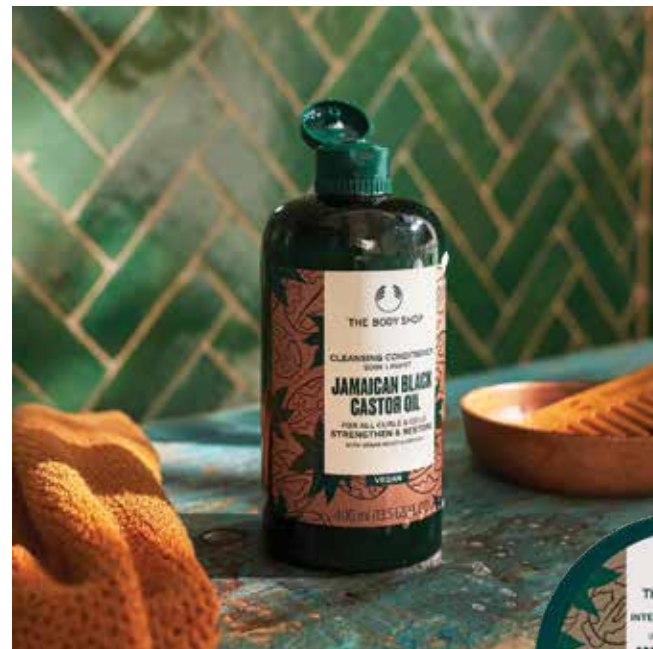
THE BODY SHOP Jamaican Black Castor Oil Cleansing Conditioner, $19, Intense Moisture Mask, $20, thebodyshop.com.