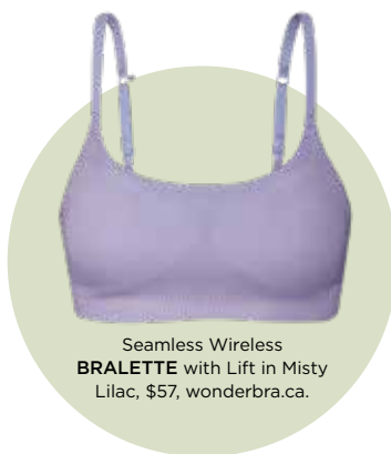
Seamless Wireless BRALETTE with Lift in Misty Lilac, $57, wonderbra.ca.