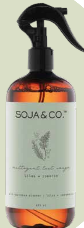
Soja&Co. Lilac & Rosemary All Purpose CLEANER, $12, sojaco.ca.

With a soothing scent that's reminiscent of a spring breeze, Soja&Co.'s all-purpose cleaner is a versatile addition to your cleaning arsenal. Made in Quebec, the biodegradable formula boasts a neutral pH that makes it ideal for many different types of surfaces, from granite to wood to leather. We love that it's safe for the air in your home—that means it contains no irritating ingredients for the respiratory tract—and is vegan and animal-cruelty free. Get ready for shiny surfaces and the fresh smell of lilac, orange and rosemary throughout your home.