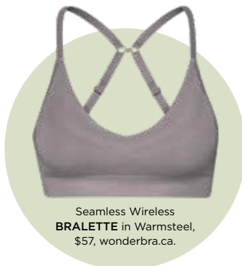
Seamless Wireless BRALETTE in Warmsteel, $57, wonderbra.ca.

Wonderbra is back with another home run in the undergarment game! Two wireless bralettes and one full-support minimizer are the new additions to the brand's EcoPure line—bras made with recycled fibres that boast style, comfort and functionality. Cute colours and convertible straps mean you can wear these bras with anything, on any occasion. Love!