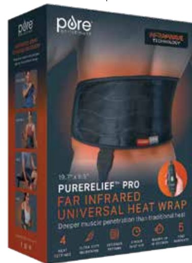
PureRelief Pro Far Infrared Universal HEAT WRAP, $73, pureenrichment.com.

The latest innovation from wellness brand Pure Enrichment is something we can totally get behind. The company's new Pro Far Infrared line of heat therapy products is designed with InfraWave Technology that penetrates muscles more deeply than your run of the mill heating pads. We love the Universal Heat Wrap, which can be secured around your shoulders, arms, legs or torso for relief of muscle aches, menstrual cramps, joint pain and more.