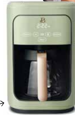
Beautiful Kitchenware by Drew Barrymore 14-Cup Programmable COFFEE MAKER in Sage Green, $80, walmart.ca.