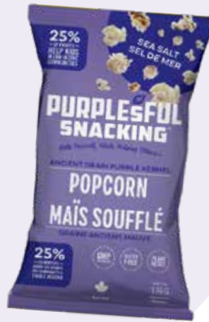
Purplesful Snacking POPCORN in Sea Salt, $5, well.ca.

This non-GMO popcorn is made from artisanal purple corn, making it rich in antioxidants. Plus, a portion of profits are invested into programs that support underprivileged children.