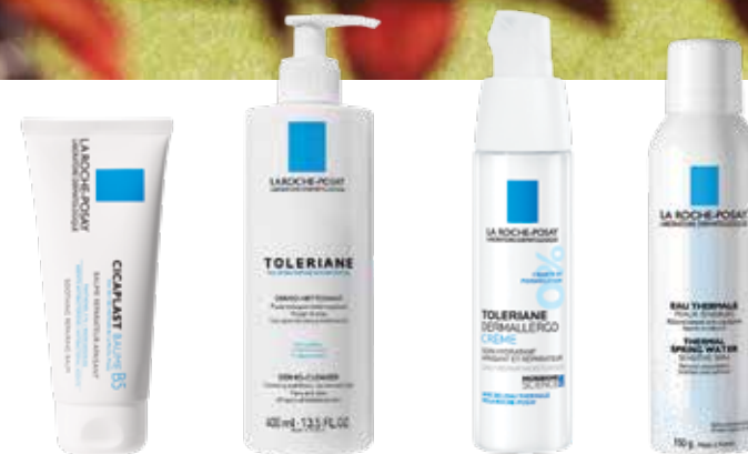
LA ROCHE-POSAY Cicaplast Baume B5+ Soothing Balm, $16.50, Toleriane Dermo-Cleanser, $31, Toleriane Dermallergo Cream, $36, Thermal Water, $16.50, laroche-posay.ca .