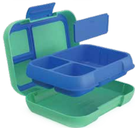
Bentgo Pop LUNCHBOX in Bright Coral/Teal and Spring Green/Blue, $40 each, bentgo.com.

It's such a drag when lunch containers crack, lose their sealing powers or warp in the dishwasher within weeks of using them—we've all been there, right? That's why we're so excited about Bentgo's new Pop lunch containers! The company is well-known for its top-notch leak-proof lunch boxes and the Pop line offers even more space for big kids and teens (and grown-ups, too!—though they do have adult designs as well...). The container holds up to 5 cups of food and has an optional divider. Plus, it comes in a fun selection of vibrant hues.