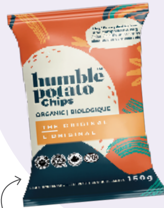
These tasty chips are certified organic and packaged in a 100% plastic-free compostable bag.

Whether you're looking for a savoury treat to put into your kid's lunchbox (or your own!) or serving up snacks at a party, these two Canadian brands offer delicious options that are not only healthier, but also do some good!