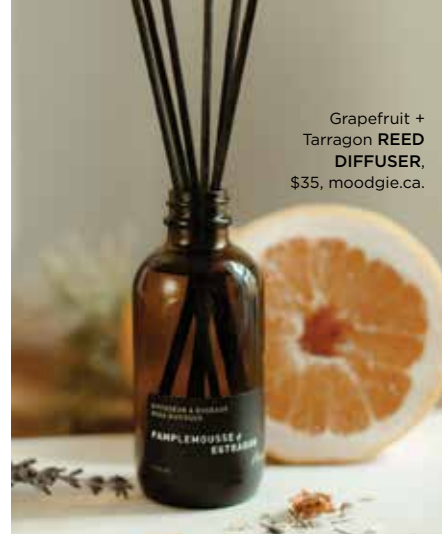
Grapefruit + Tarragon REED DIFFUSER , $35, moodgie.ca .