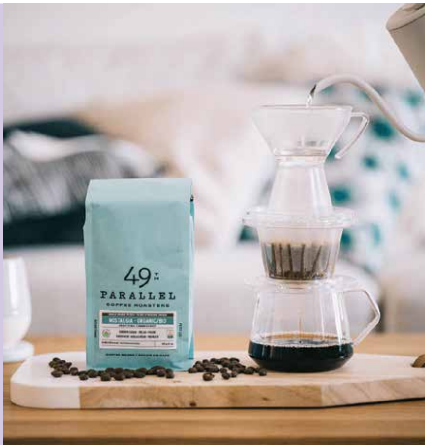
49th Parallel COFFEE in Organic Nostalgia, $20, 49thcoffee.com.

Vancouver coffee roaster 49th Parallel's commitment to sourcing only direct-trade coffee keeps their coffee beans fresh and reduces their environmental impact. The brand is known for its strict quality measures, and ensures sourcing of the highest quality coffee beans from around the world by creating long-lasting partnerships and giving back to local communities. Not only does 49th Parallel have a robust selection of delicious coffees, but they also have made them accessible to everyone through online purchasing in single bags or a monthly subscription service. Try the Organic Nostalgia coffee—its notes of brown sugar, pecan and prune are pure yum!