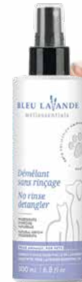
BLEU LAVANDE No Rinse Detangler, $17.50, bleulavande.com.

Just like our own hair, our furry friends' manes can also suffer from stubborn knots and tangles. Canadian company Bleu Lavande has just expanded their natural pet care collection with a leave-in detangler. Biodegradable and vegan, this product helps to strengthen your pet's coat and moisturize their skin, to boot. Enriched with lavender essential oil and hemp seed extract, this spray provides a grooming experience that doubles as a relaxing at-home spa service! Just spray onto your pet's fur, work out any stubborn knots and air dry—no rinsing required.