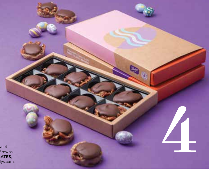
Vegan Sweet Georgia Browns CHOCOLATES, $26, purdys.com.

Chocolate Easter eggs date back to early 19th century Europe and have been a staple of Easter celebrations ever since. Whether filled with peanut butter or caramel, shaped as an egg or a bunny, we can definitely get behind indulging in some festive treats this time of year. This Easter, Purdys Chocolatier is back at it again with its delicious confections, including an adorable Easter bag filled with chocolate lollies and mini eggs, and decadent Vegan Sweet Georgia Browns. Whatever your preference, we're sure the Vancouver-based chocolate factory has something to satisfy your sweet tooth.