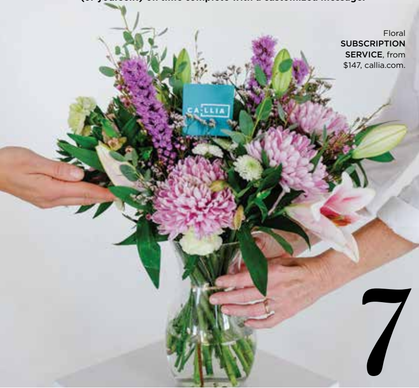
Floral SUBSCRIPTION SERVICE, from $147, callia.com.

Receiving a bouquet of flowers on a special day, or even just because, really has the power to make us feel warm and fuzzy—blooms are not only beautiful to look at, but they're a great way to remind someone how much they're loved and appreciated. With its floral subscriptions, Winnipeg-based company Callia's mission is to make sending flowers a seamless experience. Choose the length of time and frequency of deliveries and rest assured a lovely seasonal arrangement will be delivered to your loved one (or yourself!) on time complete with a customized message.