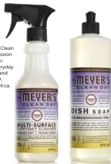
Mrs Meyers Clean Day Compassion Flower Multi-Surface Everyday CLEANER and DISH SOAP, $7 each, well.ca.

Just like washing your hands, practicing kindness is a good habit to adopt. With notes of lemon, violet and pansy, the Compassion Flower Hand Soap from household cleaning brand Mrs. Meyer's Clean Day landed in Canada last year. This year the kindness is spreading with the expansion of the scent line to include a dish soap and a multi-surface cleaner. You can now enjoy the fresh, uplifting and sweet aroma throughout your home while harnessing a little flower power to tackle stuck on dirt or tough grease.