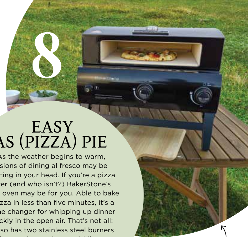
BakerStone Original Series Portable Gas PIZZA OVEN & GRIDDLE Combo with Tools, $399, homedepot.ca.

As the weather begins to warm, visions of dining al fresco may be dancing in your head. If you're a pizza lover (and who isn't?) BakerStone's pizza oven may be for you. Able to bake a pizza in less than five minutes, it's a game changer for whipping up dinner quickly in the open air. That's not all: It also has two stainless steel burners that can be used as a griddle to make omelets, fajitas and more, so there's something for every palette.