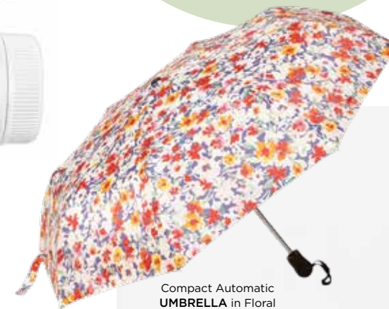
Compact Automatic UMBRELLA in Floral Three Pattern, $14, oldnavy.ca.

Umbrellas are a must-have for rainy April days. Show off your personality while keeping dry with one of these stylish options.