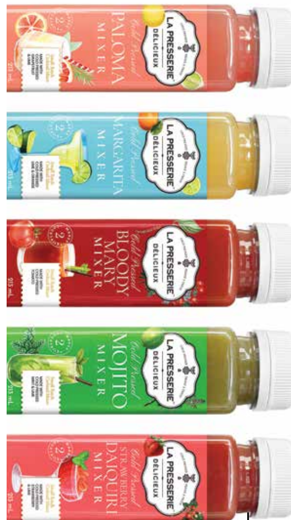
Cold Pressed COCKTAIL MIXERS Variety Pack, $42, lapresserie.com.

Canadian company La Presserie is elevating cold-pressed juices and smoothies with its new cold-pressed cocktail mixers. This new launch of six flavours, including Margarita, Paloma and Mojito, makes it a breeze to mix delicious drinks at home, all without the juicing, muddling and mess. The mixers are never pasteurized and contain no artificial ingredients or added water, so you can be sure that you're getting a high-quality beverage with the flavour and nutrition benefits of fresh fruits and vegetables. Just add alcohol (and club soda for some flavours), and you have a delicious craft cocktail you're proud to serve. We'll drink to that!