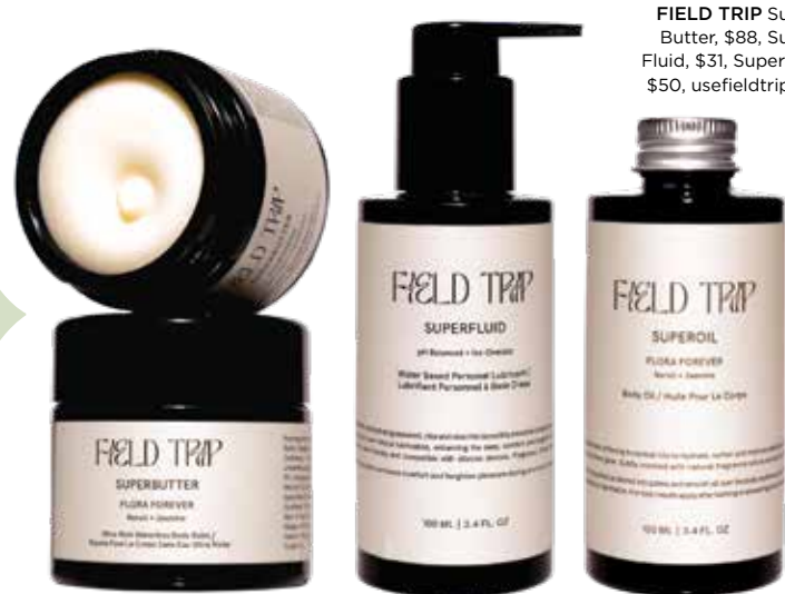
FIELD TRIP Super Butter, $88, Super Fluid, $31, Super Oil, $50, usefieldtrip.ca.