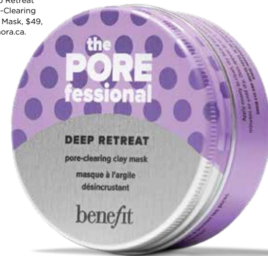
BENEFIT COSMETICS Deep Retreat Pore-Clearing Clay Mask, $49, sephora.ca.

Did you know you have more than 20,000 pores on your face? To take care of each and every one, Benefit Cosmetics has released an all-new collection of products to minimize, clear and smooth pores. The Pore Care Collection offers a cleanser, toning foam, cleansing oil and more. We love the creamy Deep Retreat clay mask with kaolin clay, sea fennel extract and bisabolol—it gently draws out oil while keeping skin comfortable and super soft.