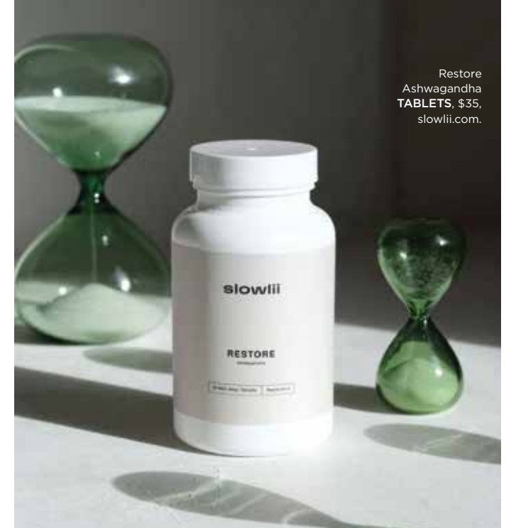
Restore Ashwagandha TABLETS, $35, slowlii.com.