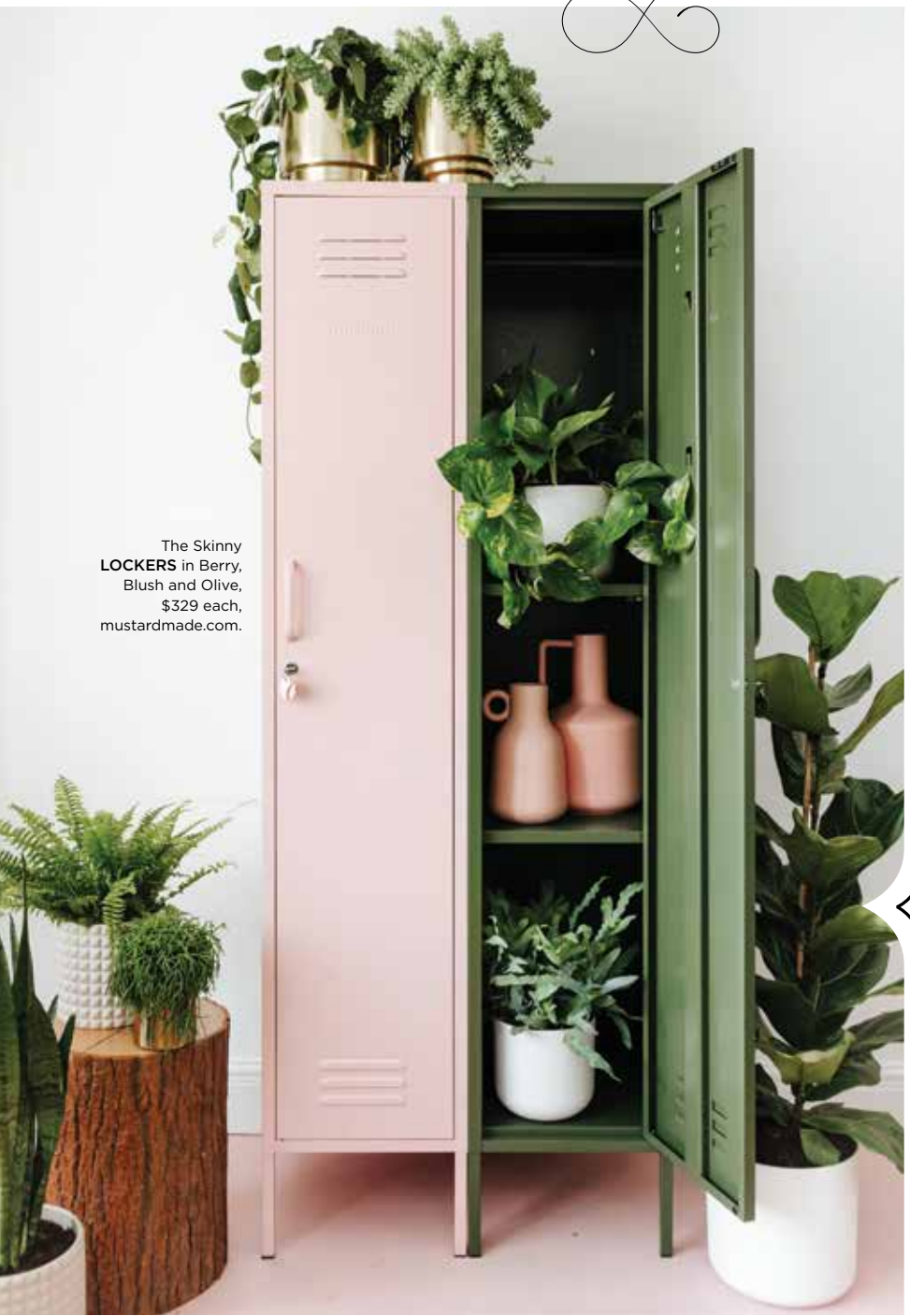
The Skinny LOCKERS in Berry, Blush and Olive, $329 each, mustardmade.com.