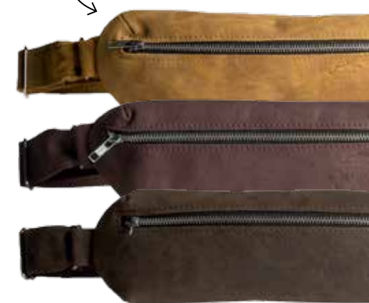
Marnie & Michael The Mady Sling-Back BAG, $90 each, marnieandmichael.com.