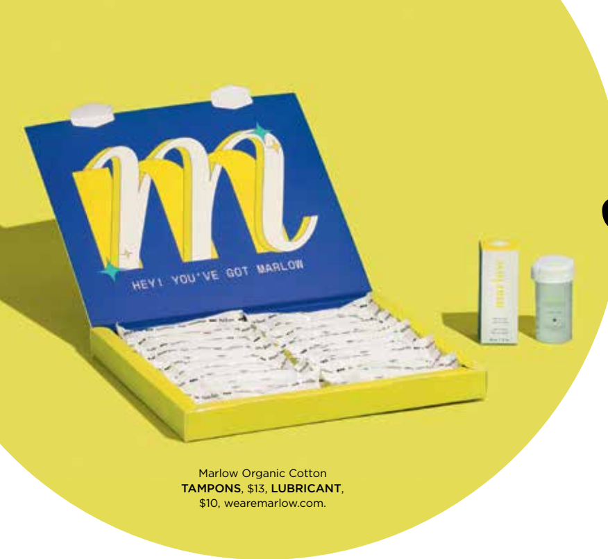
Marlow Organic Cotton TAMPONS, $13, LUBRICANT, $10, wearemarlow.com.