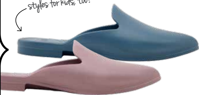
Native Shoes Ava Bloom MULES in Not So Blue Skies or Wildflower Purple, $65 per pair, nativeshoes.com.

Check out the brand's fashionable yet functional styles for kids, too!