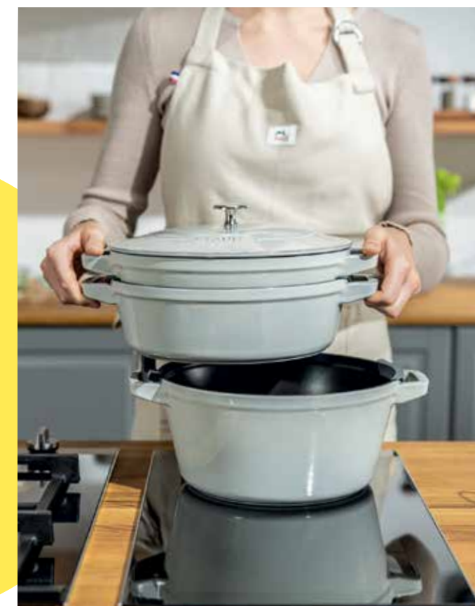
Staub La Cocotte Stackable Round 4-Piece Cast-Iron COOKWARE SET in Graphite Grey, $699, zwilling.ca.

We all know the pain of trying to efficiently store our pots and pans, whether in a cupboard, drawer or on pot hooks. They're awkwardly shaped and take up a lot of space! Enter the La Cocotte cookware set, which includes a round cocotte, braiser, grill pan and universal lid, all made of high-quality cast-iron. The set conveniently stacks together for easy, stylish storage.