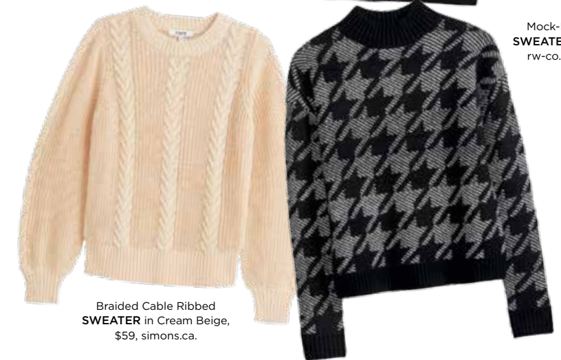
Mock-Neck SWEATER, $80, rw-co.com .