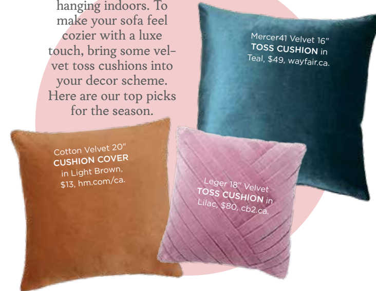
Cotton Velvet 20" CUSHION COVER in Light Brown, $13, hm.com/ca.