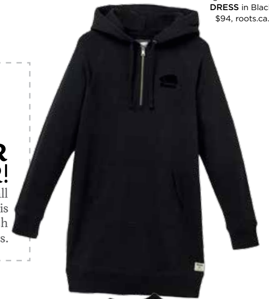
Womens Dockside Longsleeve SWEATER DRESS in Black, $94, roots.ca .

Cozy up on crisp fall days with one of this season's most stylish and comfy pullovers.