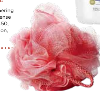
PRODUCER, MARIANNE DAVIDSON. PHOTOGRAPHY, ISTOCKPHOTO/E (SHOWER PUFF)